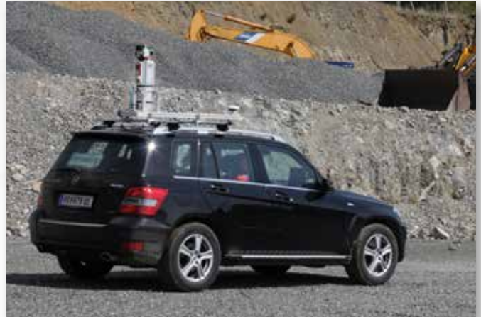
Measurement of Bulk Material, Surveying in Open-Pit Mining