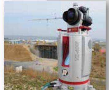
NIKON® DSLR camera for mobile and terrestrial applications