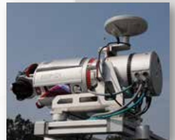
horizontal setup for, e.g. road surface scans