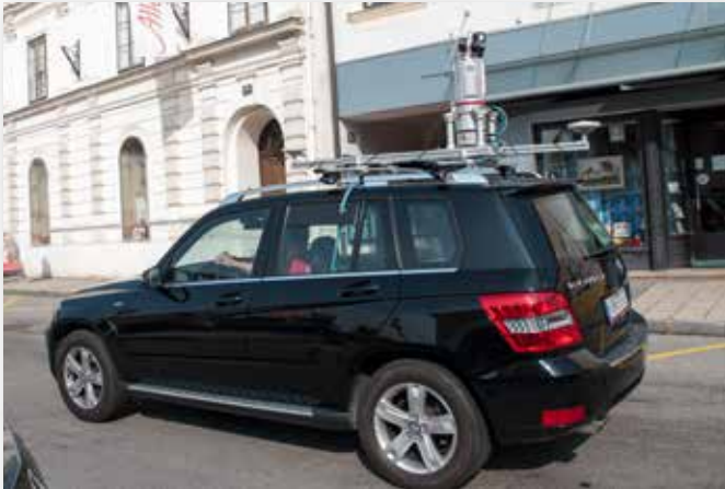
GIS-Applications and Asset-Management