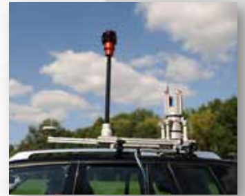
vertical scanner setup with additional panoramic camera system

Seamless RIEGL workflow for MLS data acquisition, processing and adjustment is provided by RIEGL's proven software suite.